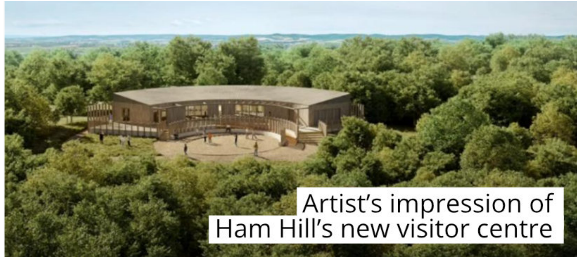
Artist's impression of Ham Hill's new visitor centre